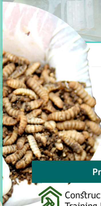
BUSINESS OPPORTUNITIES THAT ARE LIKELY TO BE CREATED